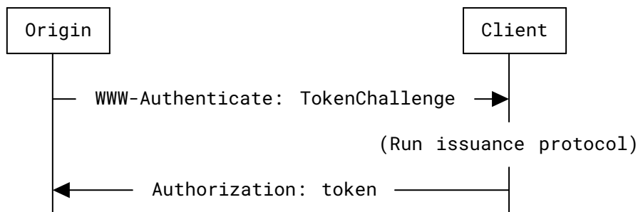
Figure 1: Challenge and Redemption Protocol Flow

In addition to working with different token issuance protocols, this scheme optionally supports the use of tokens that are associated with Origin-chosen contexts and specific Origin names. Relying parties that request and redeem tokens can choose a specific kind of token, as appropriate for its use case. These options (1) allow for different deployment models to prevent double-spending and (2) allow for both interactive (online challenges) and non-interactive (pre-fetched) tokens.